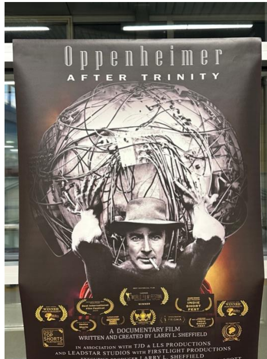
Oppenheimer: After Trinity documentary film poster

(As published in The Oak Ridger's Historically Speaking column the week of July 24, 2023)